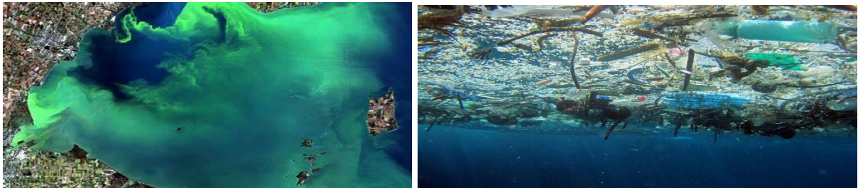
Harmful algae bloom and marine debris that are life threatening to marine species.

IT IS SLOWLY KILLING THE PLANET - there is a saying that says “you never know the importance of something until you lose it” which is very true. But, we urge us all to not let this saying be true for our country and planet. Because losing both means being homeless and the human race being extinct. We only have one true country, one planet, and our careless handling of waste is harming it. therefore, it is our responsibility to restore what we have damaged.