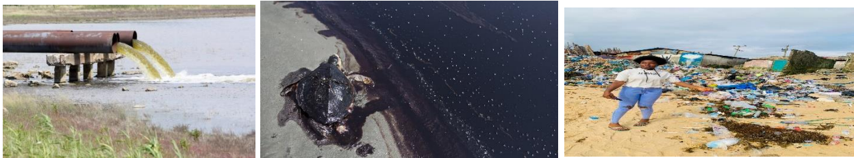
Various forms of pollution

BAD IMPACT ON HEALTH -this applies to wastes disposal workers and other recycling processing plants. Exposure to improperly handled wastes can cause skin irritations, blood infections, respiratory problems, growth problems and even reproductive issues.