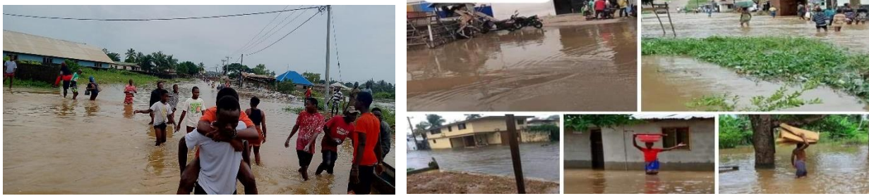
Flooding in various regions of the country

CAUSES EXTREME CLIMATE CHANGES - decomposing wastes emits greenhouse gases that rise to the atmosphere and traps heat on the earth. These greenhouse gases are the major culprits behind the extreme weather changes in Liberia and other countries around the world are experiencing. From heavy storms and rain, flooding, erosion, forest fires outbreaks to smothering heat, it's all because of these greenhouse gases.